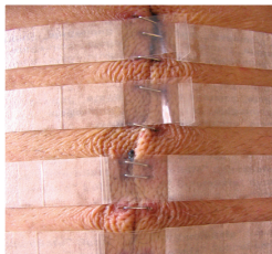
SutureSafe application over staples provides support against dehiscence.