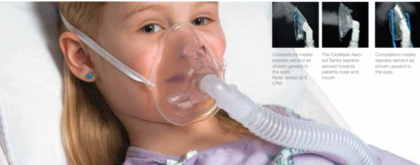
Aerosol flow WITHOUT obstruction: