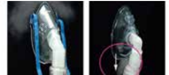
Aerosol flow WITH obstruction:

Competitors masks express aerosol as shown upward to the eyes