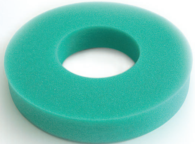
Circular Head Support